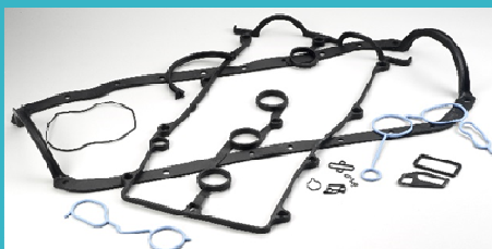
RUBBER MOLDED GASKET