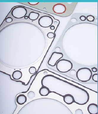
RUBBER-TO-METAL BONDING GASKET